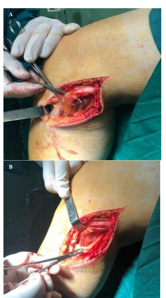
Figure 2. Intraoperative exploration of nerve showing thickened and transformed peroneal nerve

control, but it was not helpful. With this mind, impression in a surgery performed for decompression of the cyst and exploration of the peroneal nerve. Based on the explorations, the deep peroneal nerve was swollen and thickened in distal 3 cm before division to final branches. It was seemed that the nerve was replaced by a gelatinous mass. A longitudinal incision was made on the cyst wall, and it was appeared that a fusiform cystic mass, full of gelatinous liquid, was located inside the epineurium and pushed the nerve fascicles aside (Figure 2, A and B).